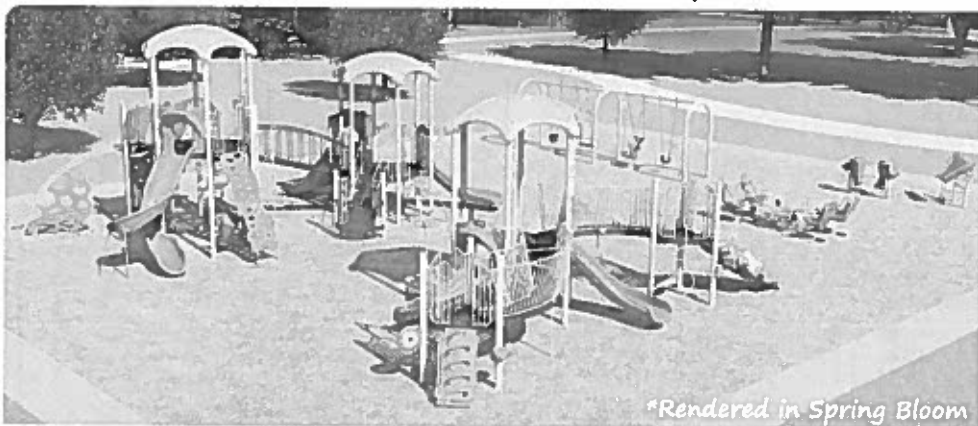
*Rendered in Spring Bloom